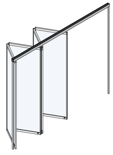
3D ISOMETRIC VIEW